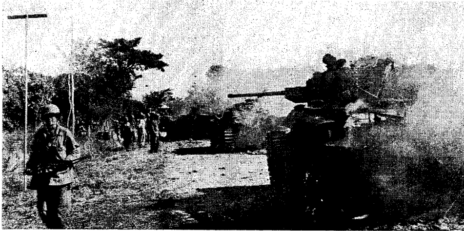
Another view of the cluttered road.

While the 53d Field was moving howitzers to more advantageous positions, the 80th Field was doing the same. Two howitzers of Battery "B" were moved to fire on Highway 5 in the direction of Munoz, while one howitzer of Battery "A" was aimed directly at the highway east of the battalion position. Howitzers of Battery "C" did not have to be changed.