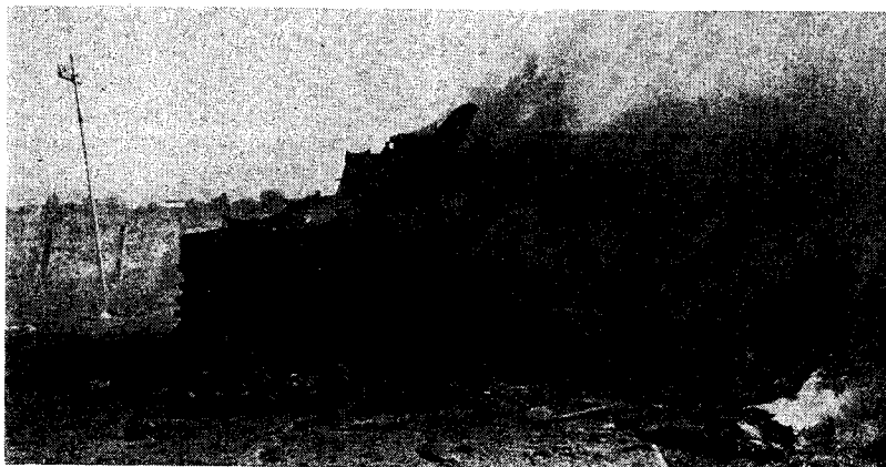
After the tanks were repulsed, the artillerymen proceeded to destroy the attacking column.

The Japanese survivors of Munoz, in the next five hours after they began their retreat, were destroyed. Daybreak that morning saw the fleeing tank and armored column blown to shapeless smoking debris, littering Highway 5 for several miles between Munoz and San Jose. The battle that morning between the enemy tank column and two tractor-drawn field artillery battalions is a story in itself, and a fitting climax to the battle of Munoz.