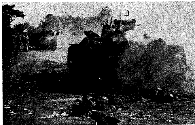
A view of the battleground after the battle shows Jap tanks smoldering on the highway.

Munoz was strategically important as a bastion of defense for Japanese lines of supply and communication on Highway 5 leading to San Jose and mountain regions to